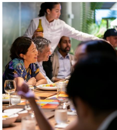
SoCal Venture Pipeline Alumni Dinner