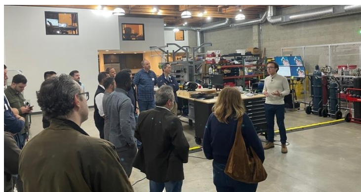
El Segundo Deep Tech Walking Tour