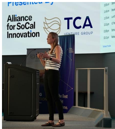
Best of the Best w/Tech Coast Angels at UCI